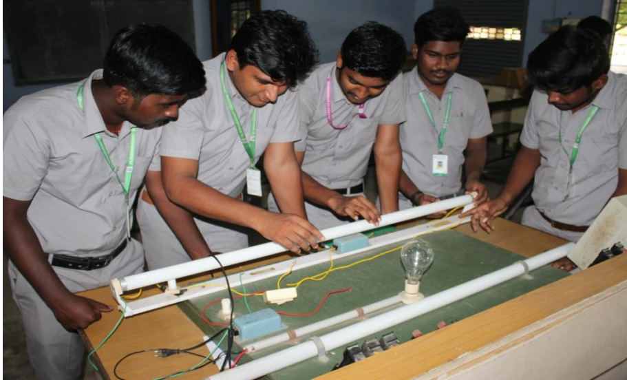
Figure 6.11 Snapshot of Basic Electrical and Electronics Engineering Laboratory

Area of the laboratory: (9.9 \times 8.7 = 86.13 \text{ m}^2)